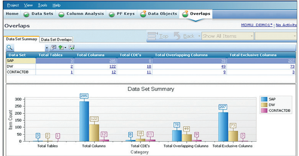
CA ERWIN DATA PROFILER PULLS TOGETHER INFORMATION FROM ACROSS THE BUSINESS

CA ERwin Data Profiler delivers a single source of record from all compared data sources.